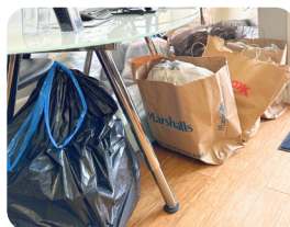
Clothing donated by generous neighbors and Hillman Homes clients and agents.