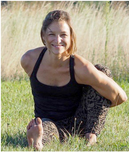
Visit Theresa Briggs Yoga at theresabriggsyoga.com for the current virtual yoga schedule.