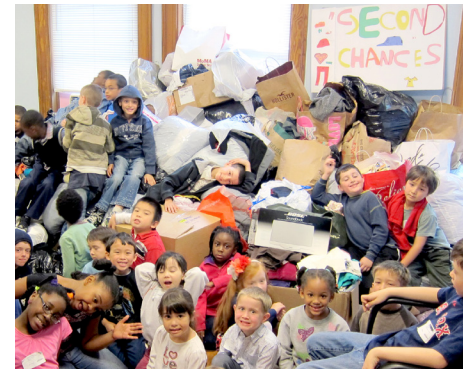
Some of our youngest volunteers involved their entire congregation in a clothing drive through their Sunday School. We're so proud of these compassionate kids!