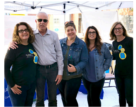
We look forward to a time when we can have in-person volunteer opportunities again. Until then, we hope you'll consider some of these options.